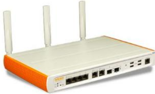
Figure 5: Aruba 600 Series Mobility Controller