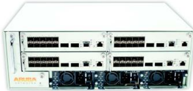
Figure 3: Aruba 6000 Chassis with four M3 Mobility Controller blades