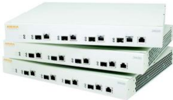
Figure 4: Aruba 3000 Series Mobility Controllers